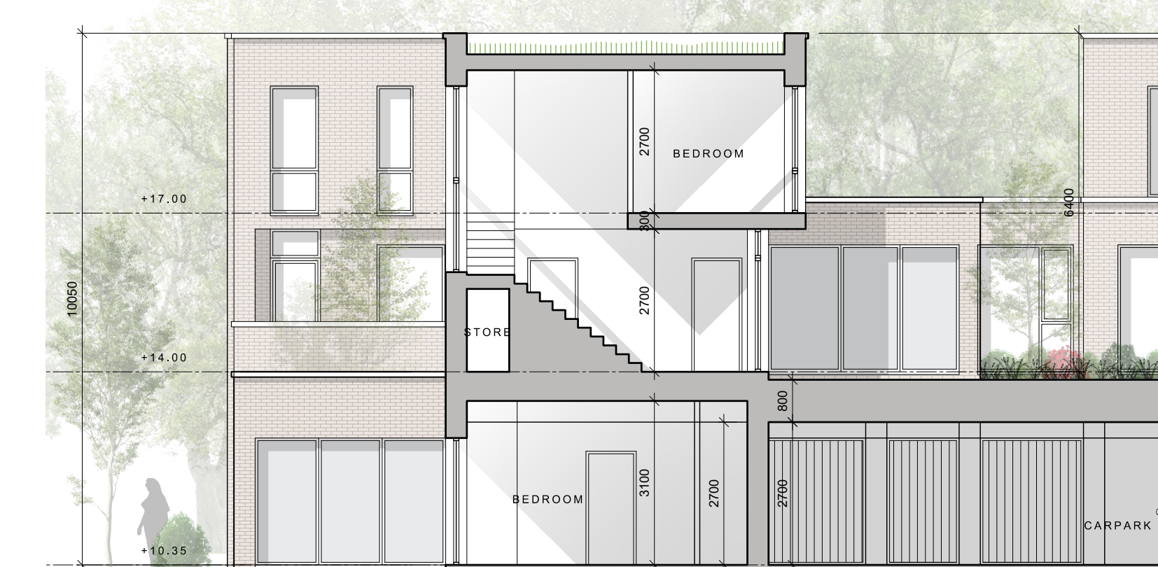
DUPLEX APARTMENT BLOCK 2A: SECTION C3-C3 SCALE: 1:100