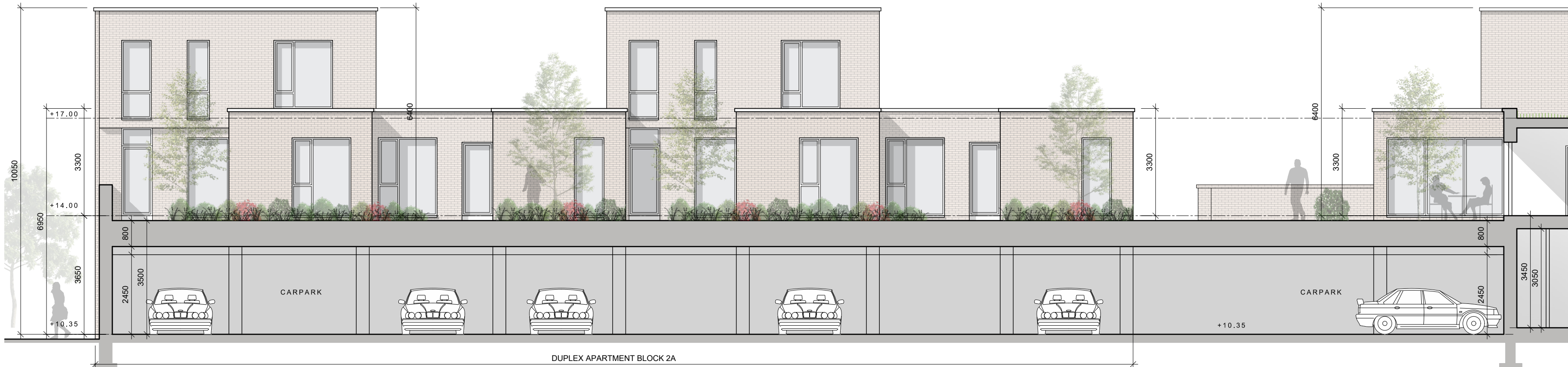
DUPLEX APARTMENT BLOCK 2A: SOUTH FACING ELEVATION SCALE: 1:100 SEE THE BIG SPACE LANDSCAPE ARCHITECTS DRAWINGS FOR DETAIL OF LANDSCAPE TREATMENT