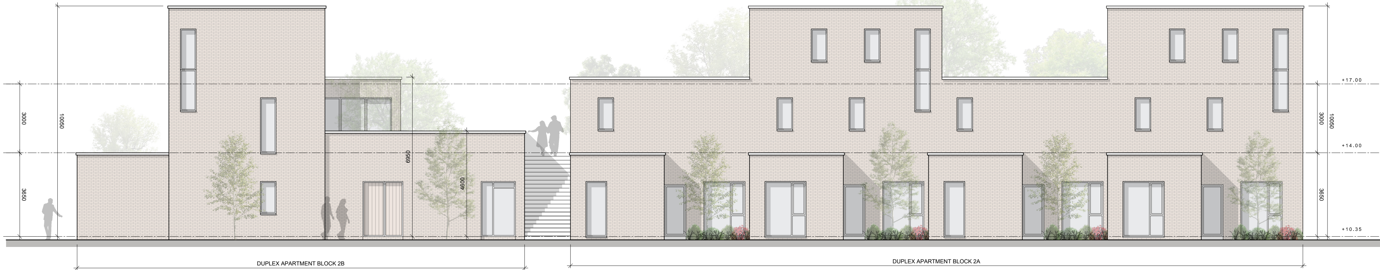
DUPLEX APARTMENT BLOCK 2A: NORTH FACING ELEVATION SCALE: 1:100