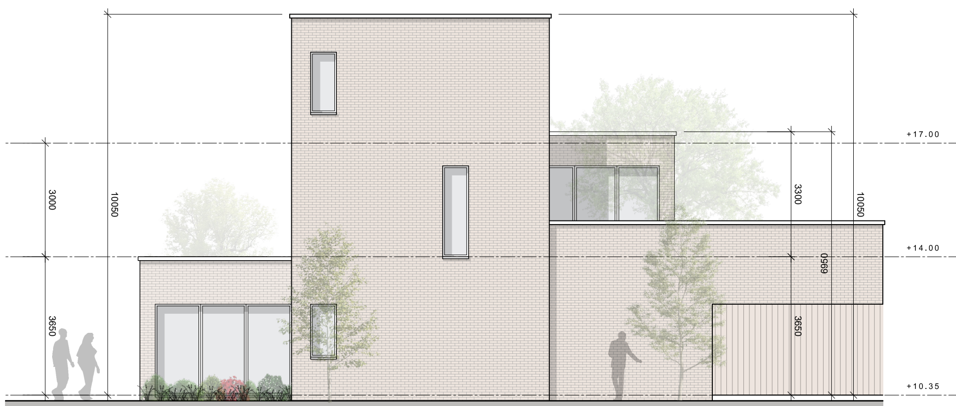
DUPLEX APARTMENT BLOCK 2A: WEST FACING ELEVATION SCALE: 1:100