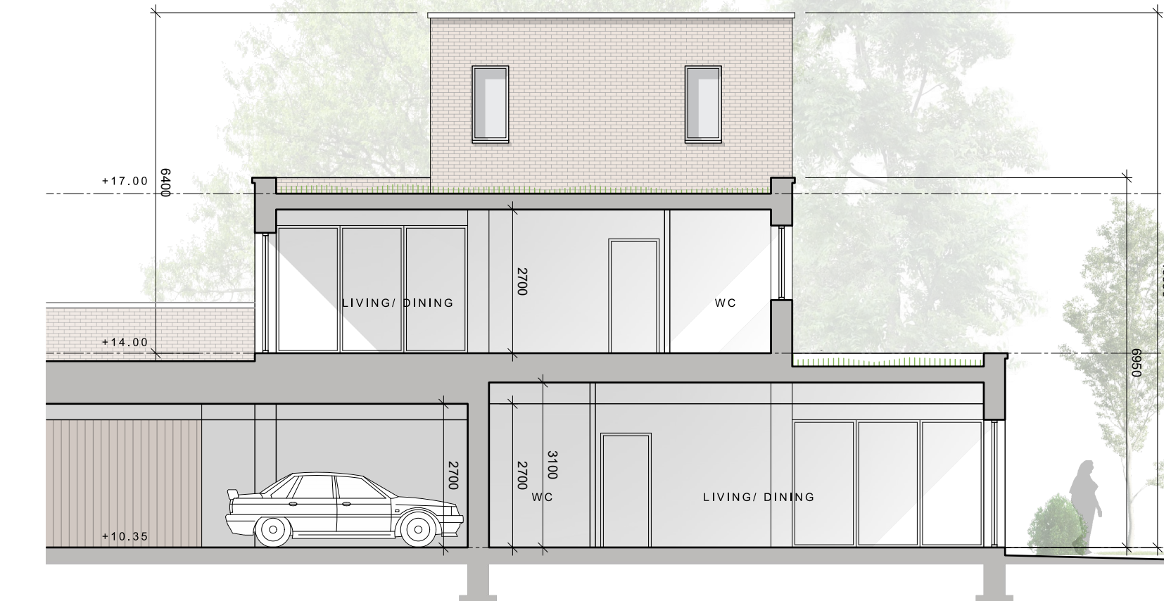
DUPLEX APARTMENT BLOCK 2A: SECTION C1-C1 SCALE: 1:100